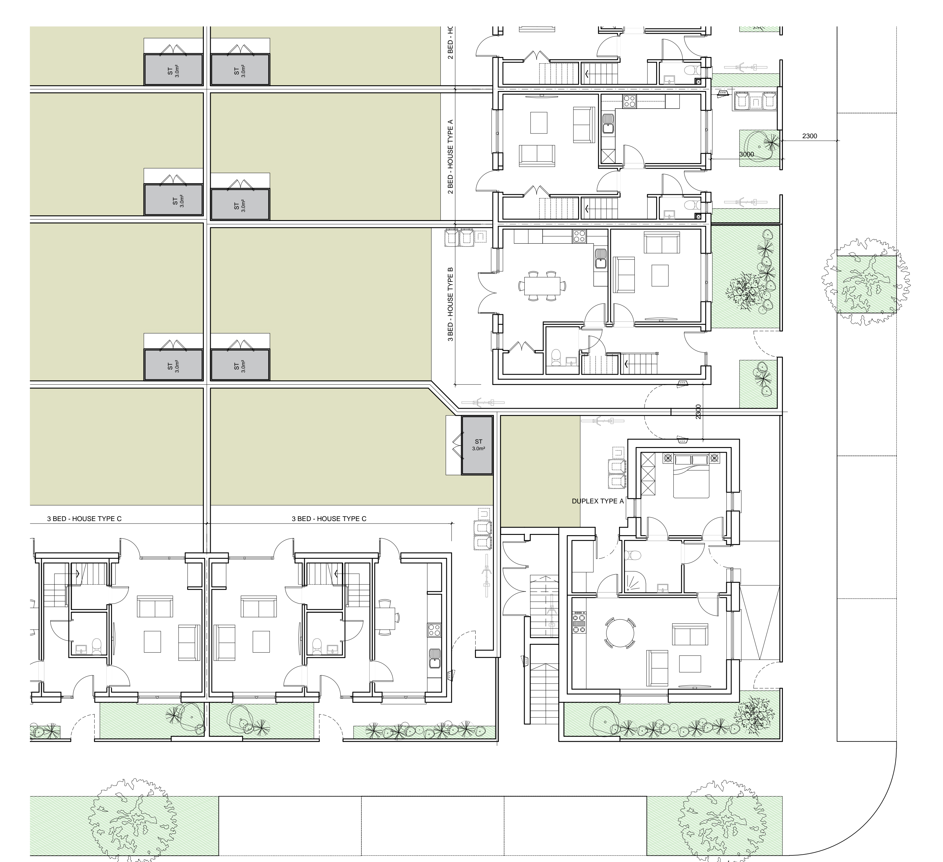
Typical Curtilage Detail - Refer to Key Plan